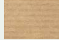
b: Mat brown kraft paper