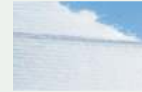
Non woven tissue 38 gr/m2 app: 160 x 160 mm

other materials not available for this size