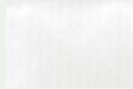
a: Mat white kraft paper