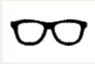
optical lens cleaning wipes