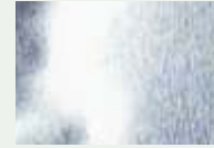
d: Silver PET